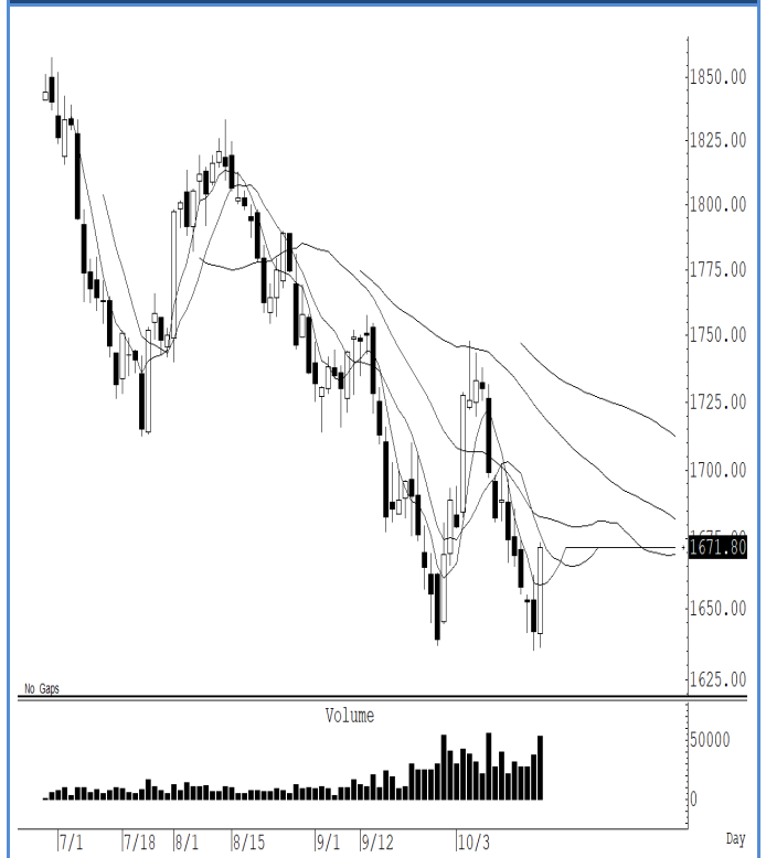
GOZ22 (Close 1,671.80 Chg 30.0)

ราคาทองคำโลกปรับตัวลงมาใกล้จุดต่ำเดิมอีกครั้ง ต้องระวังทำจุดต่ำใหม่ สั้น ๆ ไม่ต่ำกว่าแนวรับแถว ๆ 1,655 ดอลลาร์ แนะนำ trading ในกรอบระหว่าง 1,655-1,685 ดอลลาร์ ระวังกำไร ในกรณีที่ปิดต่ำกว่าระดับ 1,630 ดอลลาร์ แนะนำ ถือ short หวังผลปรับตัวลงไปแถว ๆ 1,580 ดอลลาร์ ระวังกำไร